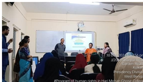
10 Dec 2024 1:50:56 pm J/206 Paharpur Road Garden Reach Kolkata Presidency Division West Bengal