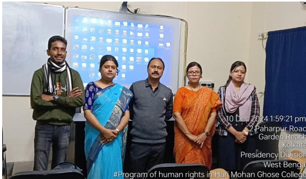
10 Dec 2024 1:59:21 pm 2 Paharpur Road Garden Reach Kolkata Presidency Division West Bengal