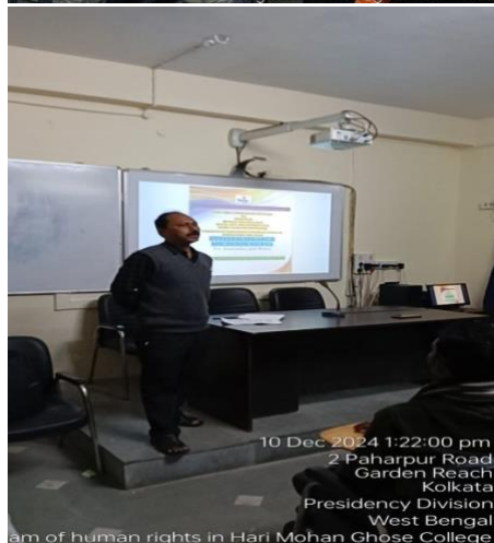
10 Dec 2024 1:22:00 pm 2 Paharpur Road Garden Reach Kolkata Presidency Division West Bengal