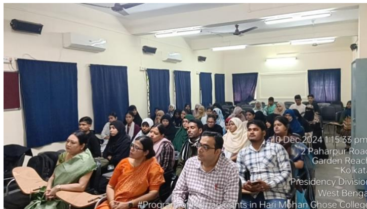
10 Dec 2024 1:15:33 pm 2 Paharpur Road Garden Reach Kolkata Presidency Division West Bengal