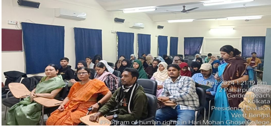
10 Dec 2024 1:21:19 pm 2 Paharpur Road Garden Reach Kolkata Presidency Division West Bengal #Program of human rights in Hari Mohan Ghose College