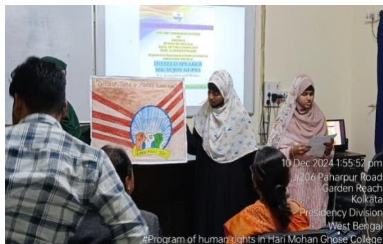
10 Dec 2024 1:55:52 pm J/206 Paharpur Road Garden Reach Kolkata Presidency Division West Bengal